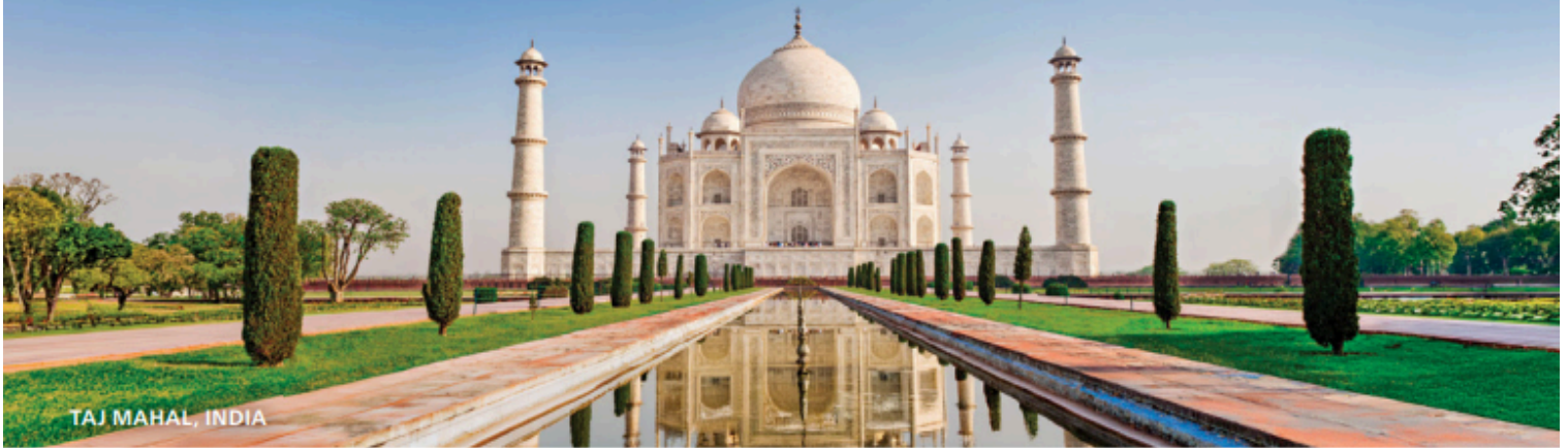
TAJ MAHAL, INDIA