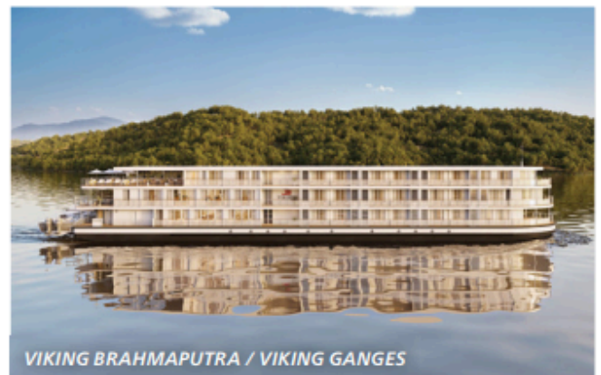
VIKING BRAHMAPUTRA / VIKING GANGES